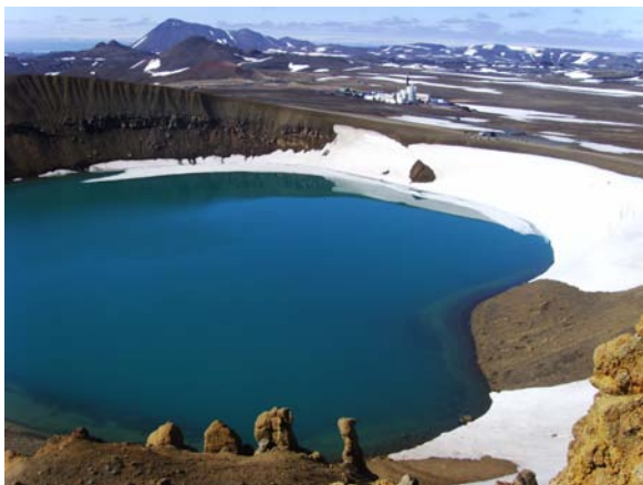
Figure 2: A view to the IDDP-1 drillsite across the Viti explosive and volcanic crater which was formed in AD 1724. The IDDP-1 well hit rhyolite magma at 2104 m depth on the platform just west of this crater. The site may be consider as ideal for attempts to create the world hottest engineered geothermal system

We close this discussion with a nice photo from the IDDP-1 drill site in Figure 2.